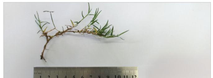
Fig 3. Close-up of live stolon.