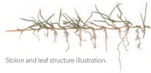
Stolon and leaf structure illustration.